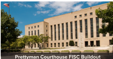
Prettyman Courthouse FISC Buildout