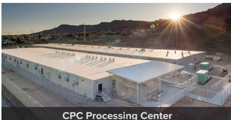
CPC Processing Center